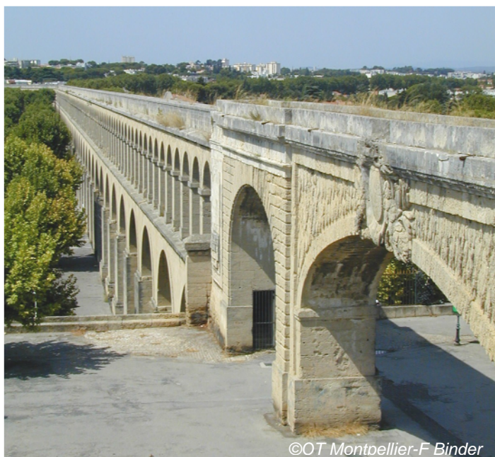
Saint Clément Aqueduct

Le Corum , Montpellier Conference Centre, is ideally located in the heart of the city, with a large choice of hotels and restaurants within walking distance.