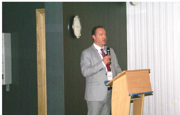
A plenary session

Some papers from other sessions included, in the "Chemical and Petrochemical industry" session, Andrzej Miodek describing the method of coating the inner surfaces of tubes in heat exchangers with the use of thermosetting lacquer to provide a smooth chemical- and scale-resistant coating and Krzysztof Szymanski and Bożena Szczucka-Lasota presenting thermally sprayed coatings as the solution for increasing the service life of machines and equipment, pointing out areas of application of specific thermal spraying method.