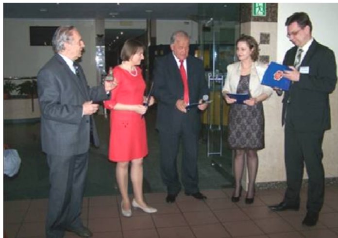
A team from the Building Structures Department of the Silesian Technical University won 3 rd prize in the best poster competition

(the bird of wisdom on the book of wisdom) and diplomas.