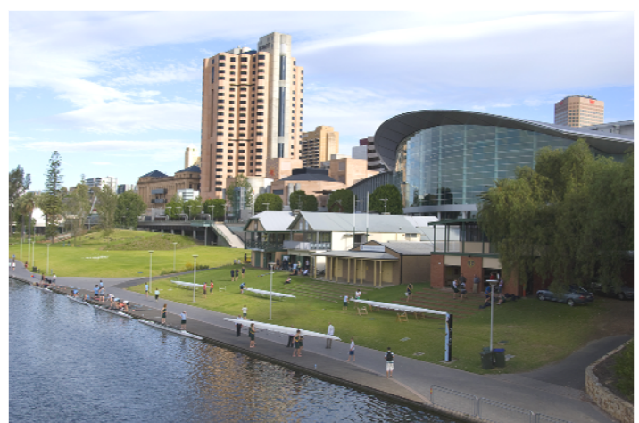
Adelaide Convention Centre, Australia

The Preliminary Technical and Social Program can be viewed at http://www.acaconference.com.au/