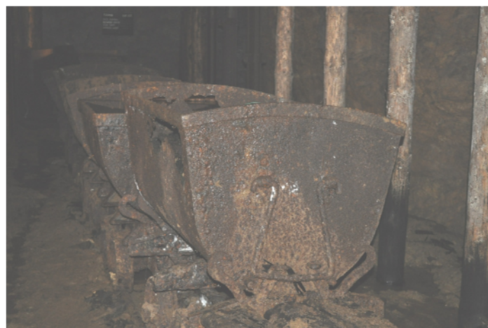
The historic Silver Mine in Tarnowskie Góry

The conference provided a forum for scientists and engineers from 39 countries throughout the world interested in the degradation of materials and materials technologies for corrosion protection. 172 of participants took a part in the meeting; 87 oral and nearly 100 poster presentations were presented.