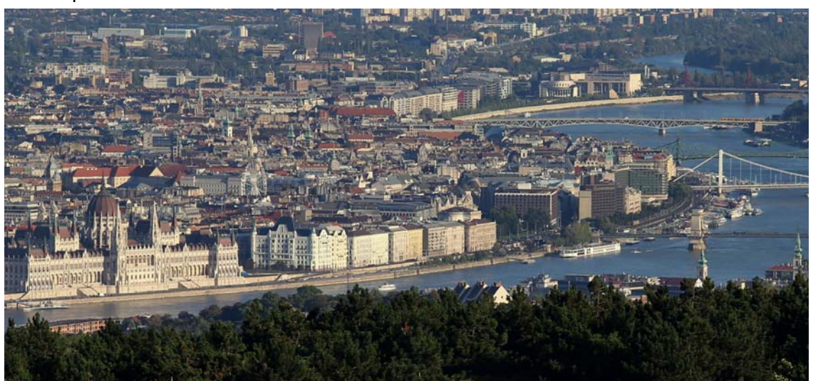
The old and new sites of the HUNKOR's headquarters are both close to the river Danube

Due to major modernisation of the HAS research centers in the country, recently the CRC became part of the Research Centre for Natural Sciences (RCNS) at a new site and in imposing new buildings, but still in Budapest.