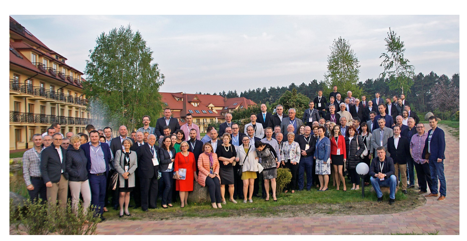
Conference participants in front of the OSSA centre