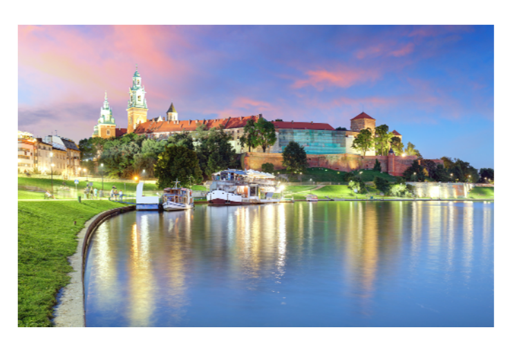
Wawel Hill in Cracow

Cracow is the second largest and one of the oldest cities in Poland. Poland's capital from 1038 till 1795, the city suffered only minor damage during the World War II and is a treasure house of architecture and art, collected since the 10<sup>th</sup> century. Cracow holds a quarter of Poland's total museum resources and it is on the UNESCO heritage list.