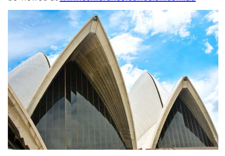
Sydney Opera House

C&P2017 will be of value to people working in a wide range of industries, including construction, oil & gas, mining, cultural and historical materials preservation, power generation, maritime, asset management, food processing and defence. The Technical Program can be viewed at <a href="https://www.conference.corrosion.com.au">www.conference.corrosion.com.au</a>