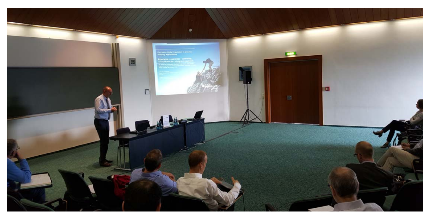
Presentation during the spring meeting of WP15 "Corrosion in the Refinery Industry"

If you wish to have more information on the activities of the group (including all the minutes and presentations of the last meetings) please visit our homepage at <a href="http://www.efcweb.org/WP15.html">http://www.efcweb.org/WP15.html</a>