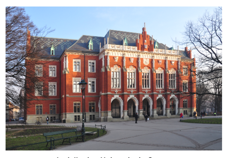
Jagiellonian University in Cracow

Cracow is the second largest and one of the oldest cities in Poland. Poland's capital from 1038 till 1795, the city suffered only minor damage during the World War II and is a treasure house of architecture and art, collected since the 10<sup>th</sup> century. Cracow holds a quarter of Poland's total museum resources and it is on the UNESCO heritage list.