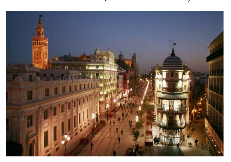
Seville by night