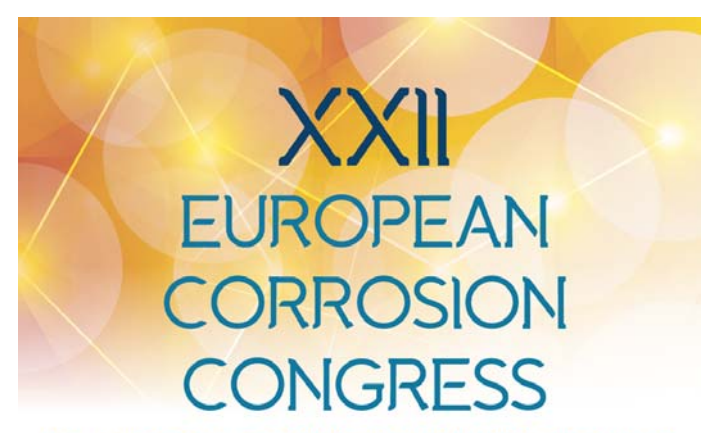
New times, new materials, new corrosion challenges