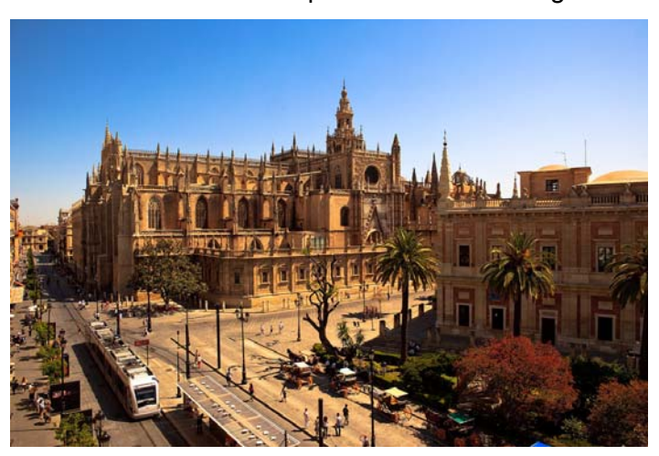
Seville Cathedral (Santa María de la Sede)

Famous for its unique atmosphere and the hospitality of its inhabitants, Seville represents the spirit of Andalusian culture. The passing through of various cultures, when this port served as one of the most important gateways to America during the 16th century, has clearly influenced its open character. Centuries of history have transformed Seville into a city with a distinctive charm, with one of the biggest and best conserved historical centres in Europe, as well as a beautiful and important artistic heritage.