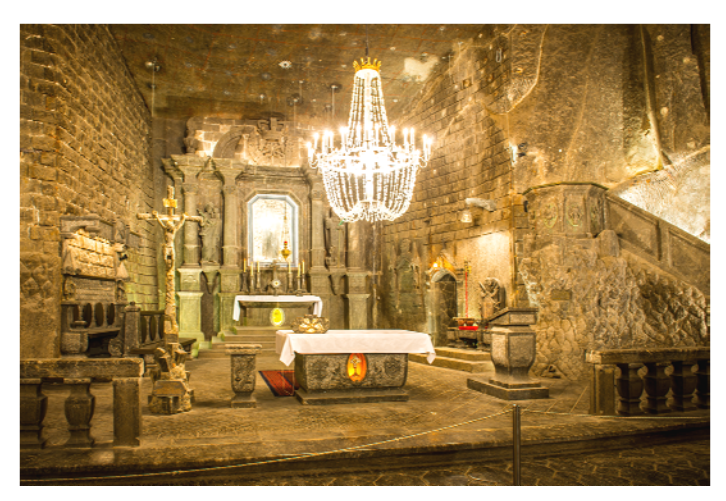
Salt Mine in Wieliczka

The Cracow region, or Lesser Poland, also offers many historical attractions for the participants of the Congress. The medieval Wieliczka salt mine with underground tourist route through miner's corridors, chambers, chapels and saline lakes, the Częstochowa sanctuary, the Auschwitz-Birkenau martyrdom museum and the Benedictine Abbey in Tyniec founded by King Casimir the Restorer in 1044.