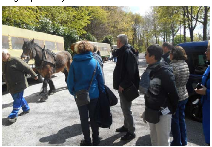
Covered wagon tour

The main social event was a 30 km tour in a covered wagon pulled by horses.