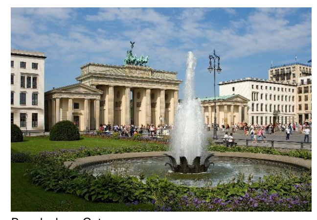
Brandenburg Gate

(Society for Corrosion Protection). The flagship event of the European Federation for Corrosion will take place in the heart of Berlin at the Berlin Central District Hotel (managed by Marriott - www.hotelberlincentraldistrict.com).