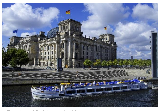
Exterior of Reichstag building

The conference programme will include plenary meetings, keynote lectures, oral and poster presentations, supported by the various EFC Working